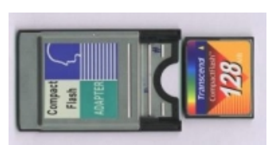
Figure 1. CompactFlash/PCMCIA Adapter